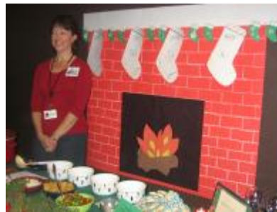
2008 Figi's, Inc. Chili Cook-off A three week event with tasting and an event, complete with displays from each finalist and local celebrity judges.

Employees cook their favorite chili recipe to be judged by coworkers. Or, have a potluck for employees to bring their favorite dishes. Attendees judge the best dish.