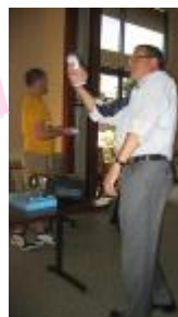
Marshfield Savings Bank Wii Tournament