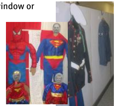
2007 Figi’s Campaign: Heroes Among Us

Have a door, window or cubicle decorating contest, with the winning team getting a free lunch or other prizes.