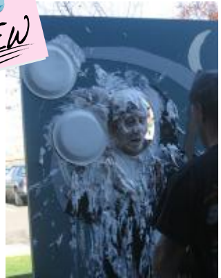
ODC ends its Halloween themed campaign by throwing pies.