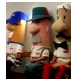
2006 Saint Joseph’s Hospital Campaign: As an incentive to employees, managers dressed up as the Miller Park Sausages and ran a mini-race.

For more distinguished coffee drinkers, offer a latte stand in the morning. Thank them for donating and remind them that for the amount of a cup of coffee or tea or candy bar each week they are providing help for a person in need.