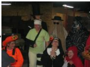
Marshfield Furniture 2008 Halloween Costume Contest

Perfect for late October campaigns—or any time you want to add excitement. Pay an entry fee for each costume, have a theme or just let imaginations run wild.