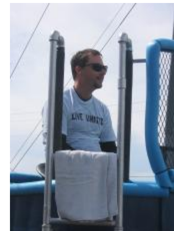
Century 21 Gold Key Realty's 2008 Family Fun Day, complete with Dunk Tank.

GoodSearch Use goodsearch.com as your default search engine and select United Way—Marshfield to raise money as you search.