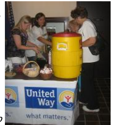
Partner Program Personal Development Center's Breakfast Stand in City Hall.

Employees will arrive early for this morning treat! Serve up orange juice, coffee, lattes, yogurt, muffins and all the fixings for a good breakfast to start the morning the right way. Also works well as an incentive!