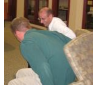
2005 Marshfield Savings Bank Campaign: Executive Chair Race

Have employees race on their office chairs using their feet or plungers to push themselves along! Set a course, create your own rules, make wagers and set penalties.